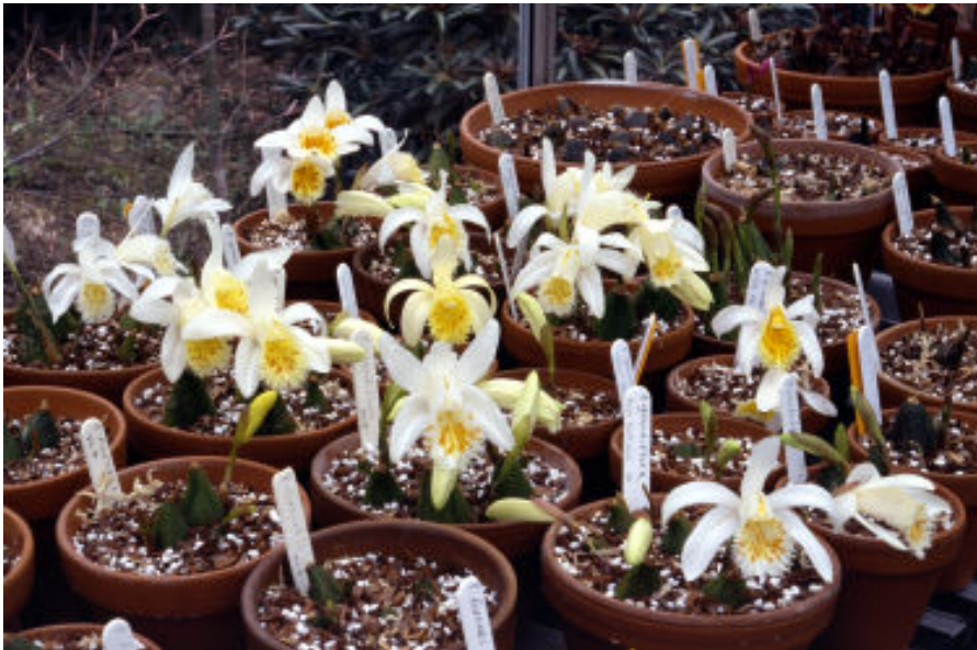
Pleione grandiflora : A collection of various forms