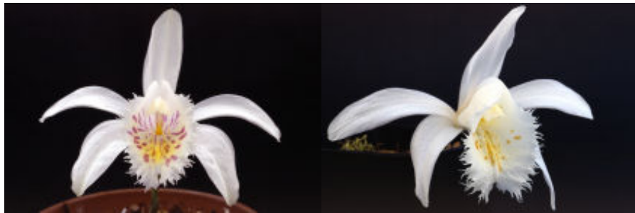
P. grandiflora : Various forms including one with purple spots (top left)