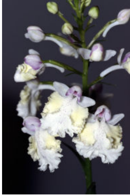
Ponerorchis : Four colour forms of the NIOH flower shape