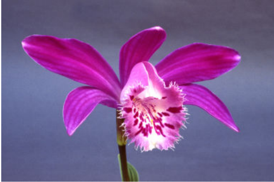
P. x barbarae : A deeply coloured form and a very pale form