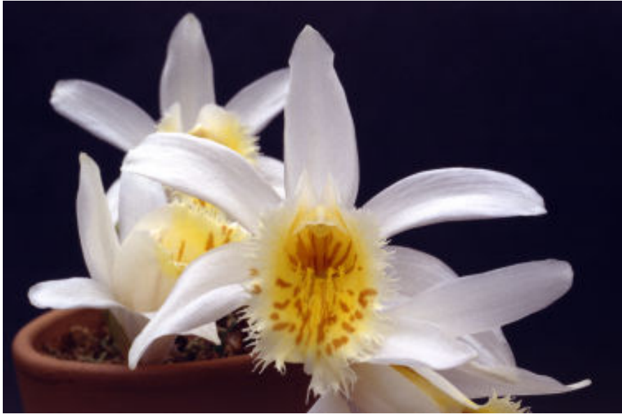
Pleione grandiflora : A fine yellow-lipped form