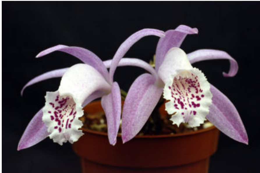
P. reichenbachiana (?): Whether you regard this as a separate species or as a form of P. praecox , it is both distinctive and beautiful