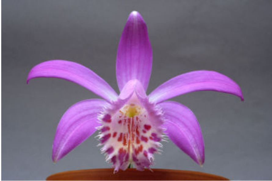
Pleione x barbarae : Several varying forms