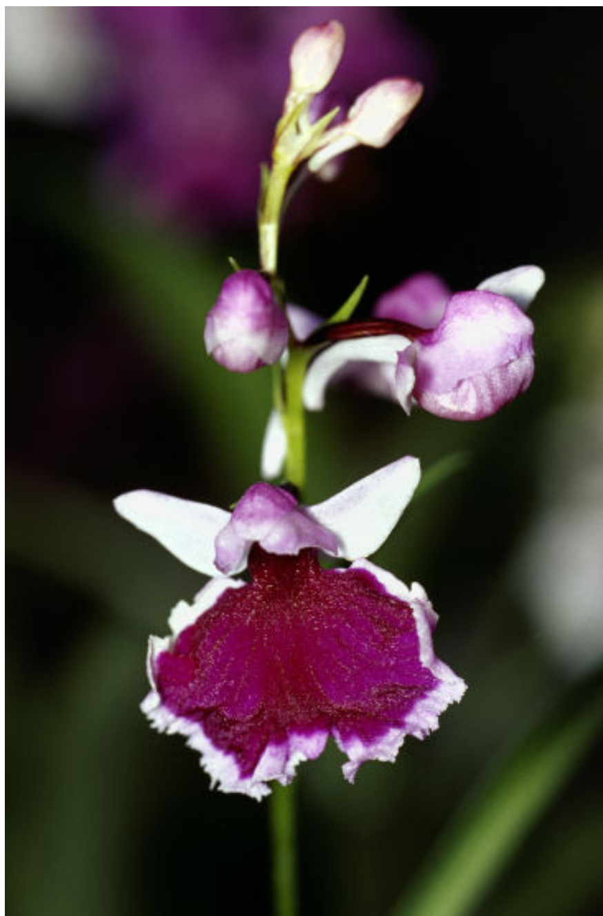
Ponerorchis : RENSETSU flower shape